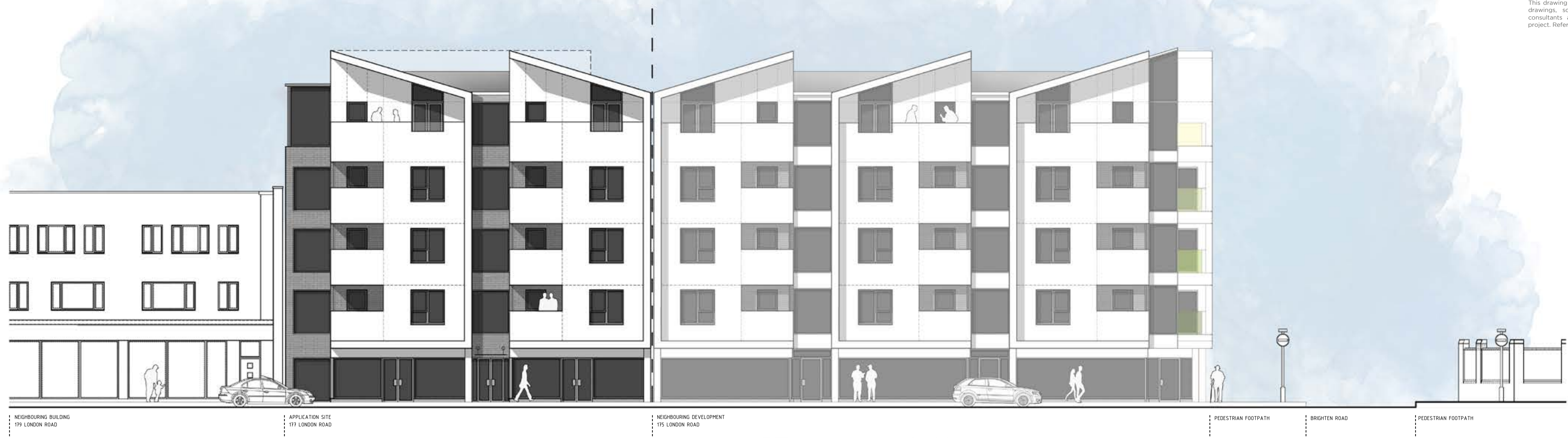
AS PROPOSED: STREET SCENE A-A ALONG LONDON ROAD

GENERAL NOTES The copyright in all designs, drawings, schedules, specifications and any other documentation prepared by DAP Architecture Ltd. in relation to this project shall remain the property of DAP Architecture Ltd. and must not be reissued, loaned or copied without prior written consent. Do not scale from this drawing, use figured dimensions only. Prefer larger scale drawings. All dimensions are in millimeters (mm) unless otherwise noted. Check all relevant dimensions, lines and levels on site before proceeding with the work. This drawing is to be read in conjunction with all Architect's drawings, schedules and specifications, and all relevant consultants' and/or specialists' information relating to the project. Refer all discrepancies to DAP Architecture Ltd.